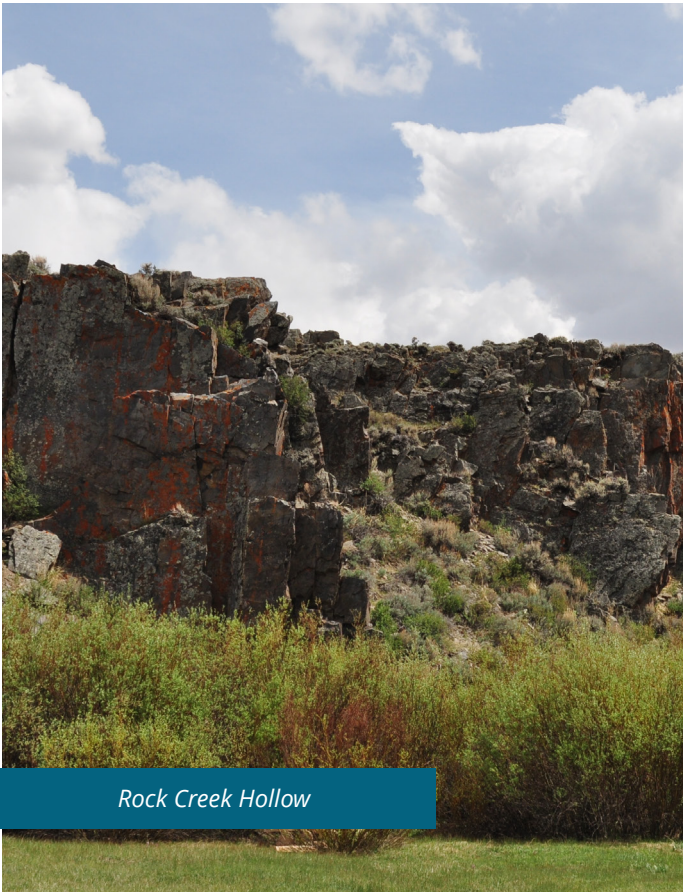
Rock Creek Hollow