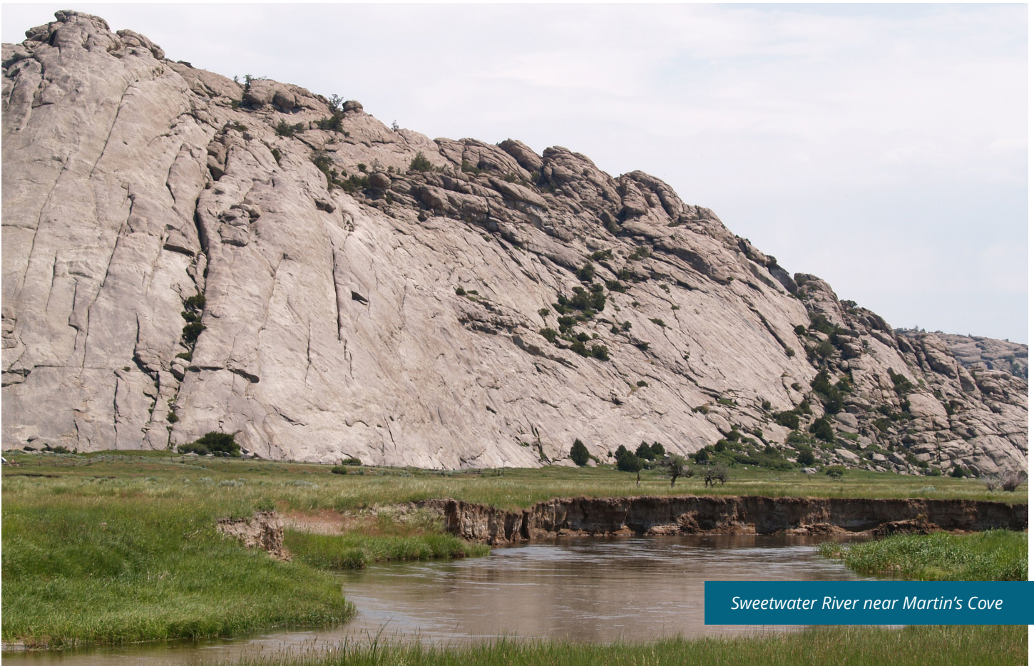
Sweetwater River near Martin's Cove