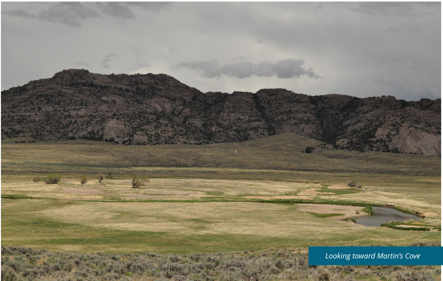
Looking toward Martin's Cove