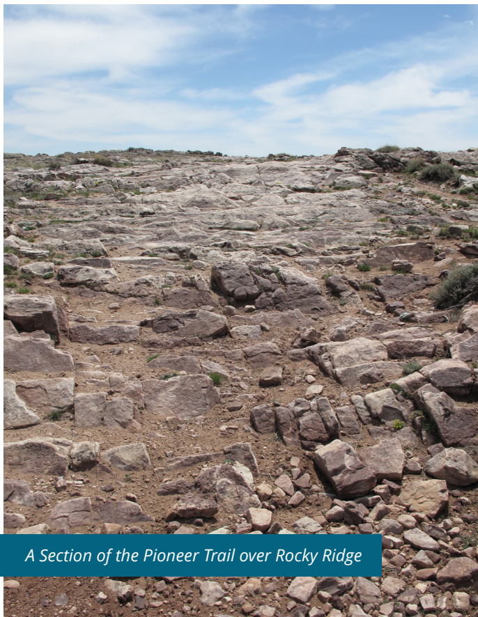
A Section of the Pioneer Trail over Rocky Ridge